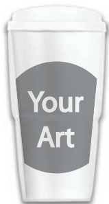
$16 D16390 24oz Acrylic Travel Tumbler