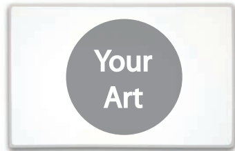
$14 D1150 Double-Sided Laminated Placemat 12" x 18"

White Green Blue Purple Yellow Red Orange Pink Chalkboard