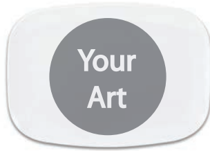
$18 D2500 Melamine Platter 10" x 13.75"